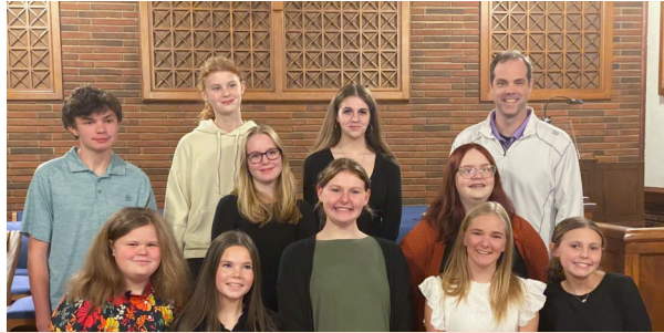
The RPC 2025 Confirmation Class